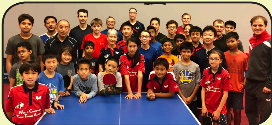
2018 Thanksgiving Camp