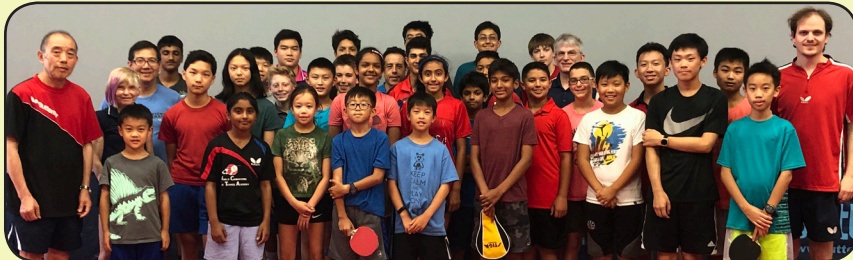
2019 Summer Camp