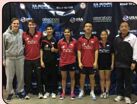
WCTTA at 2016 US Olympic Team Trials